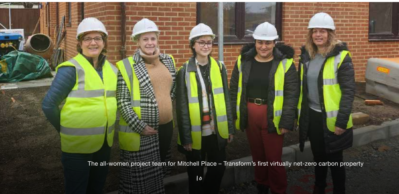
The all-women project team for Mitchell Place – Transform's first virtually net-zero carbon property