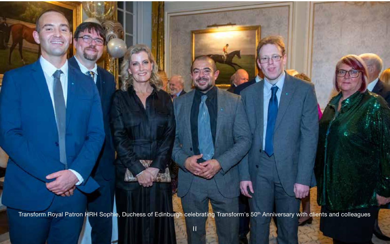
Transform Royal Patron HRH Sophie, Duchess of Edinburgh celebrating Transform's 50 th Anniversary with clients and colleagues